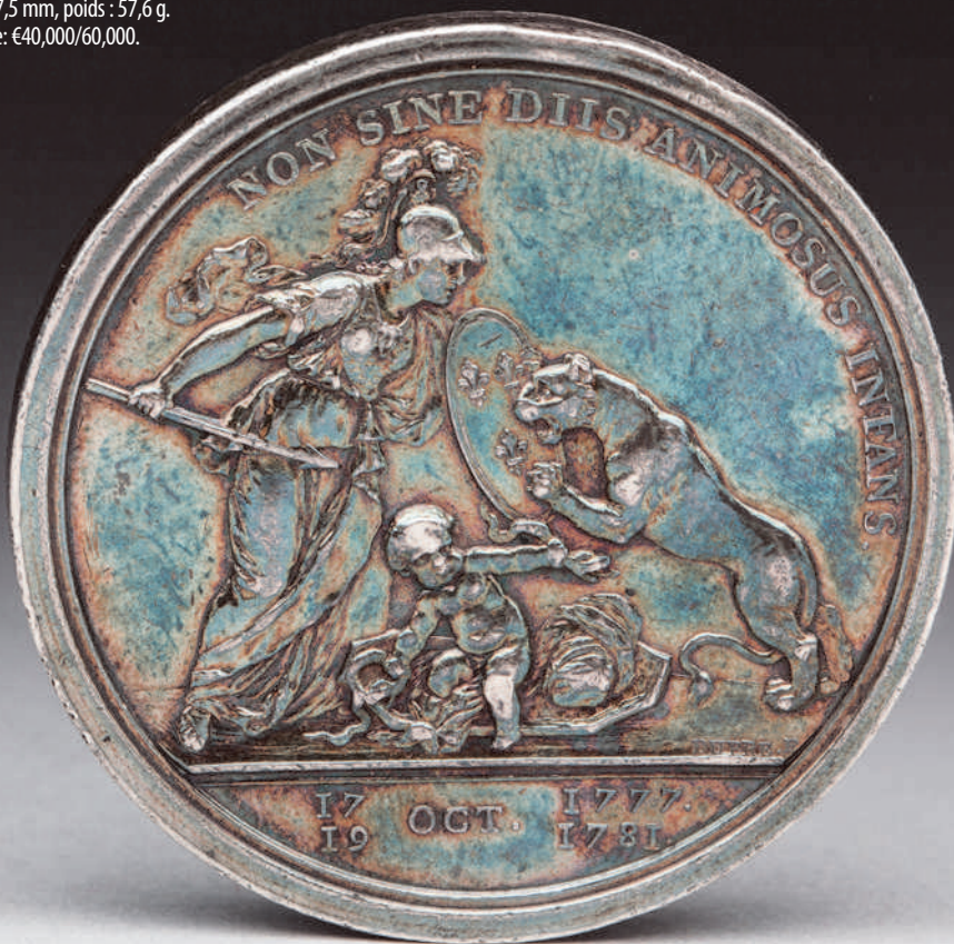
Silver medal "Libertas Americana" by Augustin Dupré, 1781, diam. 47,5 mm, poids : 57,6 g. Estimate: €40,000/60,000.

enamelled copper vessel featuring allegories of Day and Night, with gilt aluminium mounts, which joined the Empress Eugénie's collection at the Tuileries Palace the year after its creation (€50,000/80,000). As previously mentioned, various specialities will be in the limelight on Monday, when the bidding opens with Antiquities and Asian art. The star piece from Asia is a 16th century