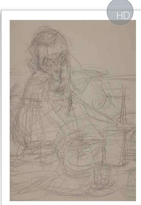
Alberto Giacometti (Borgonovo 1901 - Coire 1966). "Tériade", undated, pencil and abrasive eraser on vellum, 44 x 27.2 cm. Gift of the artist to Tériade, ca. 1941. Estimate: €50,000/70,000.

figuration with a presentation of 28 internal organs! Rumour has it that museums are lining up to acquire it. In a different vein, and almost as rare because there are just eight copies, is a -- birdcage clock with singing birds and automatons from the former collection of